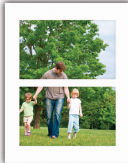
The View Through Infinity