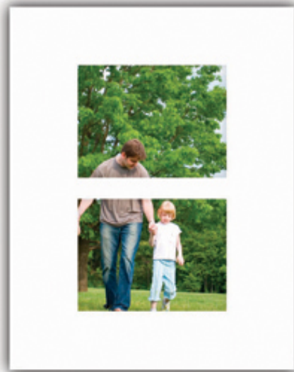
Other Replacement Windows

Strength – The strength of Ultrex allows for narrower frames, giving you more daylight and better views